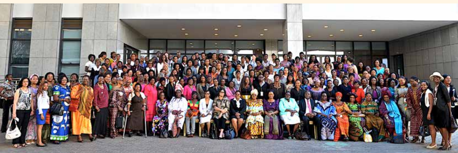
Women Steering Innovative Leadership in Africa, Malawi Conference, 2013