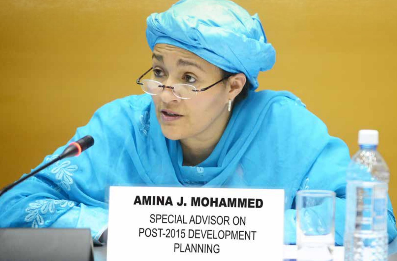
AMINA J. MOHAMMED SPECIAL ADVISOR ON POST-2015 DEVELOPMENT PLANNING