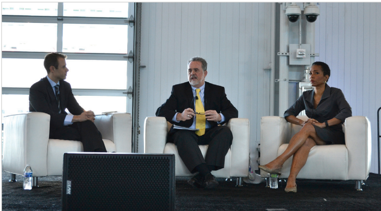
Oxfam America, CARE USA and the Clinton Foundation at the 2014 CLASSY Collaborative

Large NGOs and international agencies are not traditionally recognized for playing a significant role in driving social innovation, however over the past few years that has changed. In 2015, we expect to see large organizations stepping up more than ever as the catalysts of collaborations that support a healthy environment for social innovation.