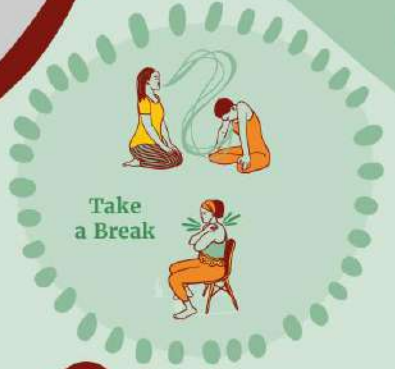
Take a Break