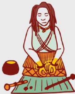
Denial of access to affordable, culturally specific and anti-oppressive health care