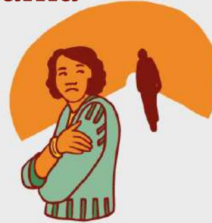
Living under relenting threat and violence