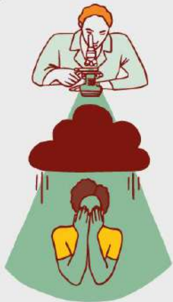
Psychiatric models that pathologize the experiences of activists