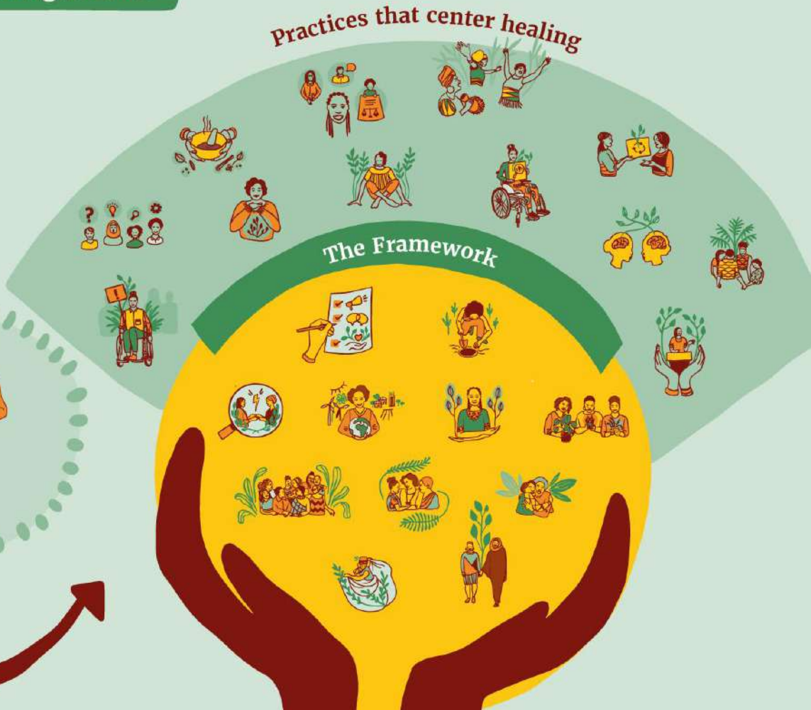
Practices that center healing