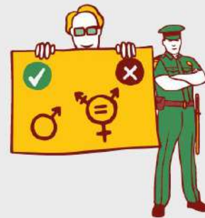
Violence against bodies that deviate from “acceptable” identities and sexual orientations