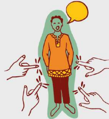
Isolation of discredited narratives