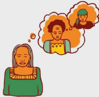
Carrying memories of generations of harm