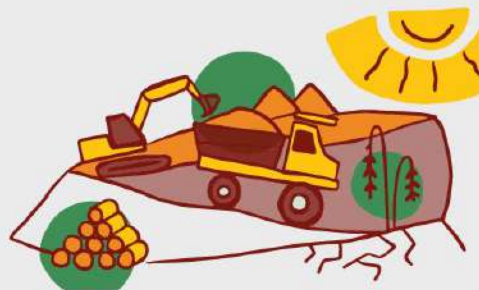
The intensification and growth of extractivism, commodification and appropriation of land and environmental degradation