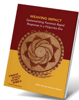
Weaving Impact: Systematising Feminist Rapid Response in a Polycrisis Era