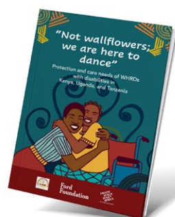
Not Wallflowers: We Are Here to Dance