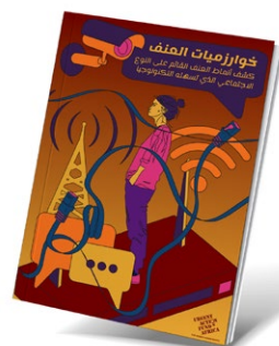
Algorithms of Violence: Exploring Trends of Technology-Facilitated GBV