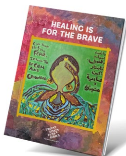
Healing is for the Brave